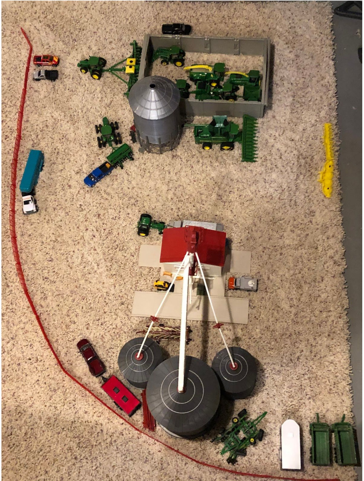
1. This is based on a family farm.